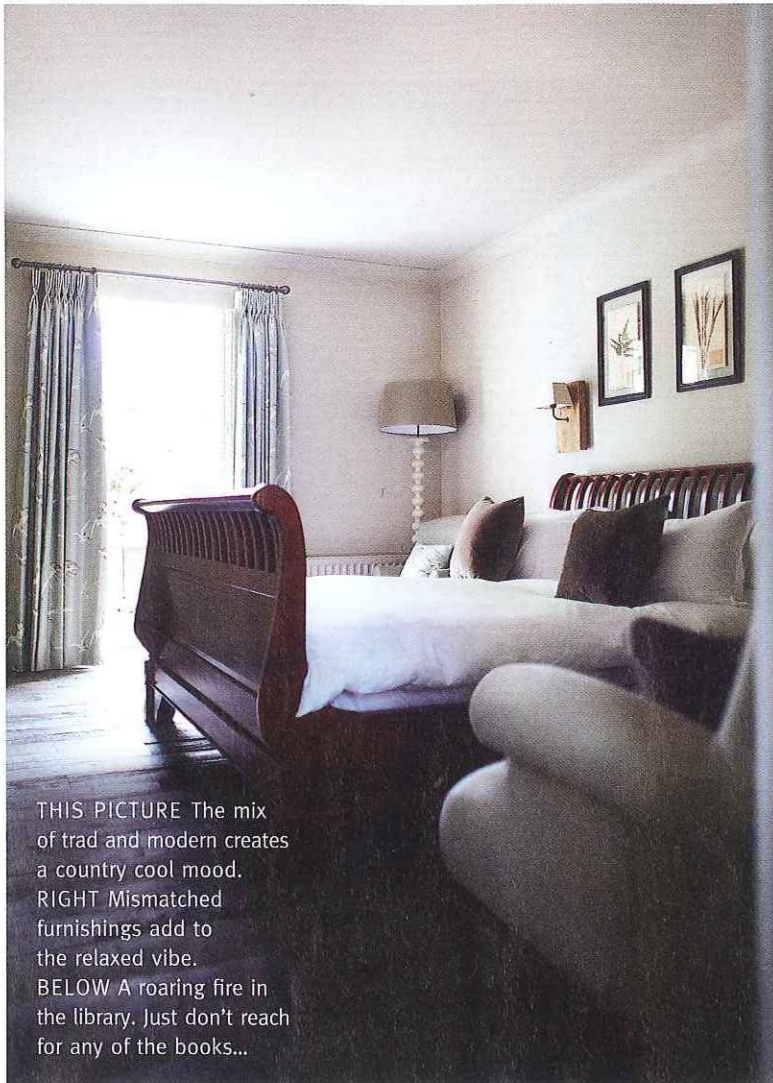
THIS PICTURE The mix of trad and modern creates a country cool mood. RIGHT Mismatched furnishings add to the relaxed vibe. BELOW A roaring fire in the library. Just don't reach for any of the books...