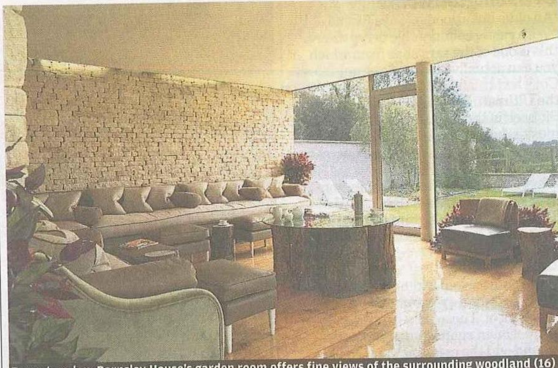
Room to relax: Barnsley House's garden room offers fine views of the surrounding woodland (16)